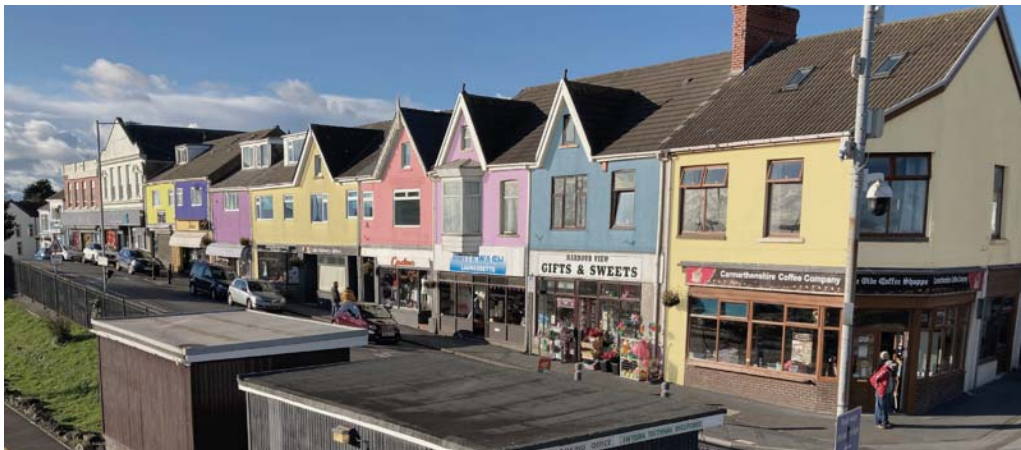
Figure 17 - Impression of Station Road