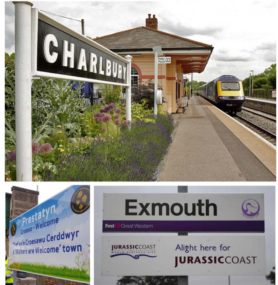
Figure 20 - Examples of station signage

“Alight here for the Millennium Coastal Path, Burry Port Harbour, National Cycle Network, Pembrey Country Park”