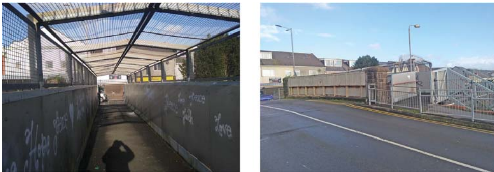
Figure 18 - Existing unattractive approach to town centre

As the primary point of access into the town centre on approach from the south, the railway bridge is extremely unattractive and inadequate in terms of accessibility and user experience. As a minimum, the bridge requires a substantial overhaul to improve its function and appearance and should ideally be replaced with a superior design.