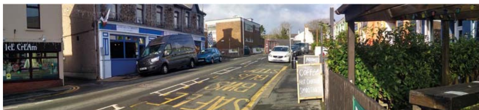
Figure 17 - View Stepney Road

Station and Stepney Road represent a characterful and locally popular centre for the town. They benefit from the lively presence of numerous businesses and the daily activity associated with the station. However, the fabric of many of the buildings and much of the public realm is jaded and detracts from the personality and appeal of the centre.