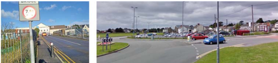
Figure 19 - Views Ashburnham Roundabout

As the primary point of access into the town centre on approach from the south, the route between the Ashburnham Road roundabout and the railway bridge is unattractive and inadequate in terms of accessibility and user experience. Improved pavements widths, crossings, boundary treatments and environmental improvements will help to provide a positive first impression.