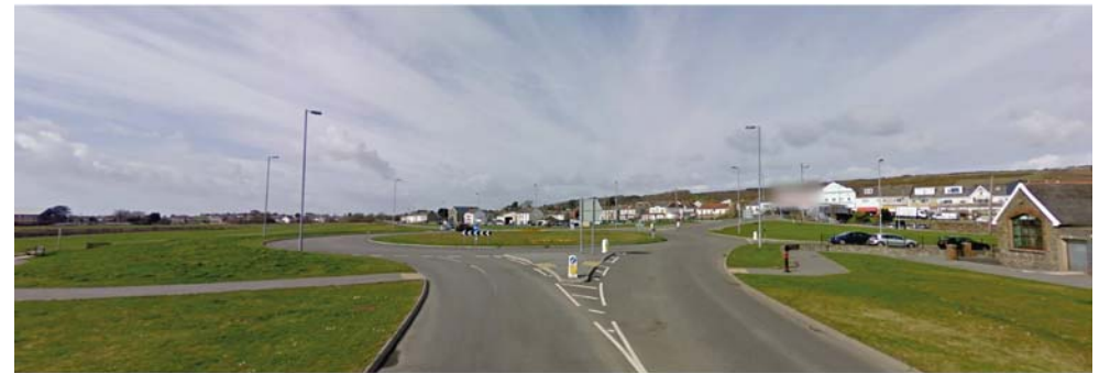
Figure 21 – Views Marina Fields